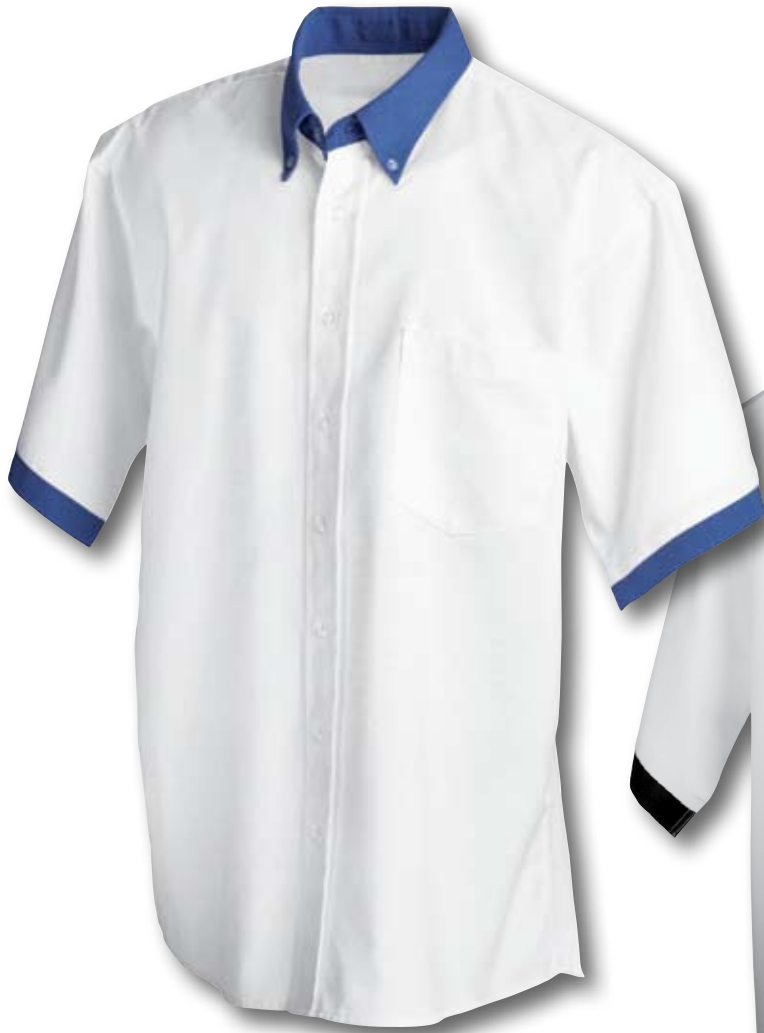
White|Dark French Blue